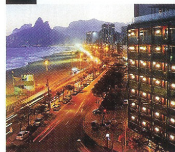
RIO GRANDE THE FASANO ON IPANEMA BEACH TOOK TOP HONORS.