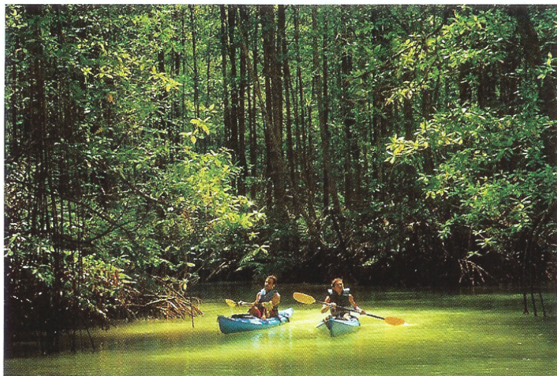
SEEING GREEN PLAYA NICUESA IS ACCESSIBLE ONLY BY BOAT. BELOW, THE ECO-RESORT'S PRIVATE DOCK, AN OPEN AIR BUNGALOW, AND KAYAKERS NEAR THE HOTEL.